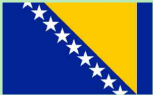
Bosnia and Herzegovina